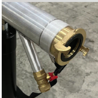
Nakajima-Type Hose Connection

A device designed to be used alongside a high-pressure water blaster for cleaning bulk carrier holds using a powerful water jet.